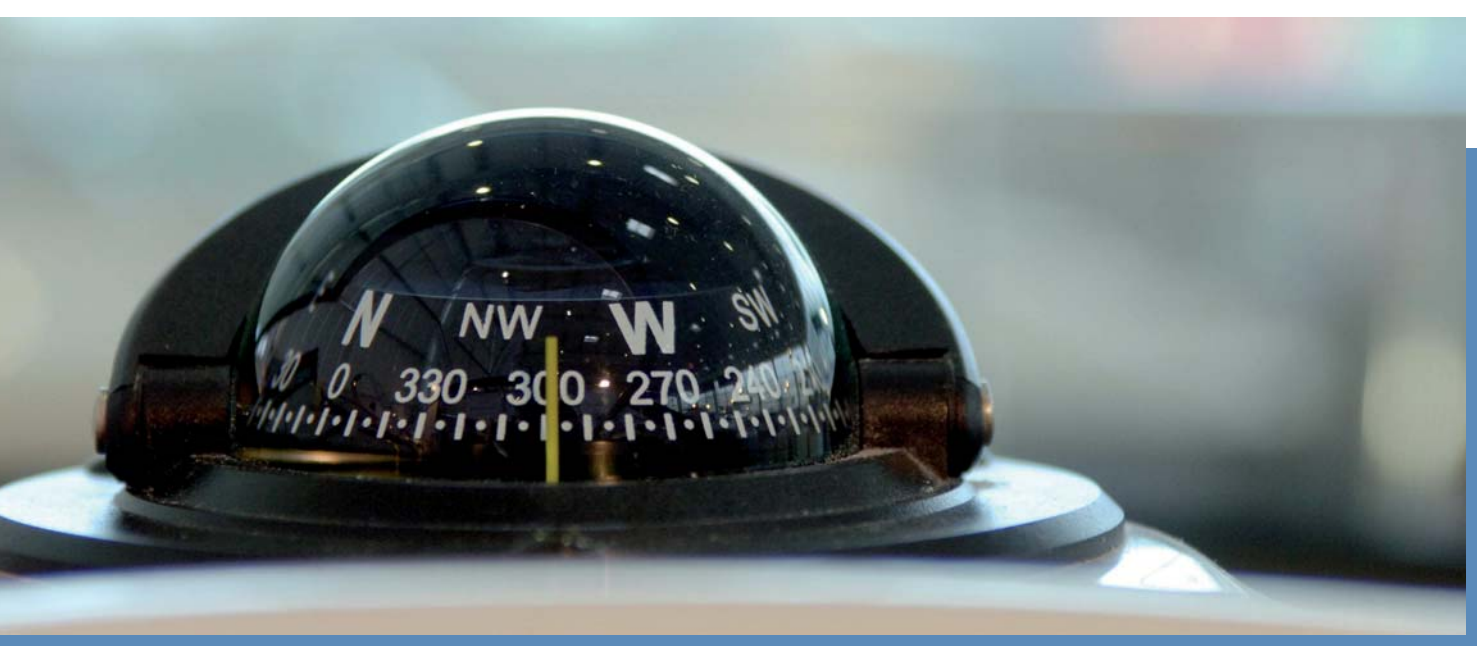
German trade fair and exhibition business is on the right course, as is also clearly evident at HMC.

Among the cities, Shanghai (30 fairs) and Moscow (29) dominate.