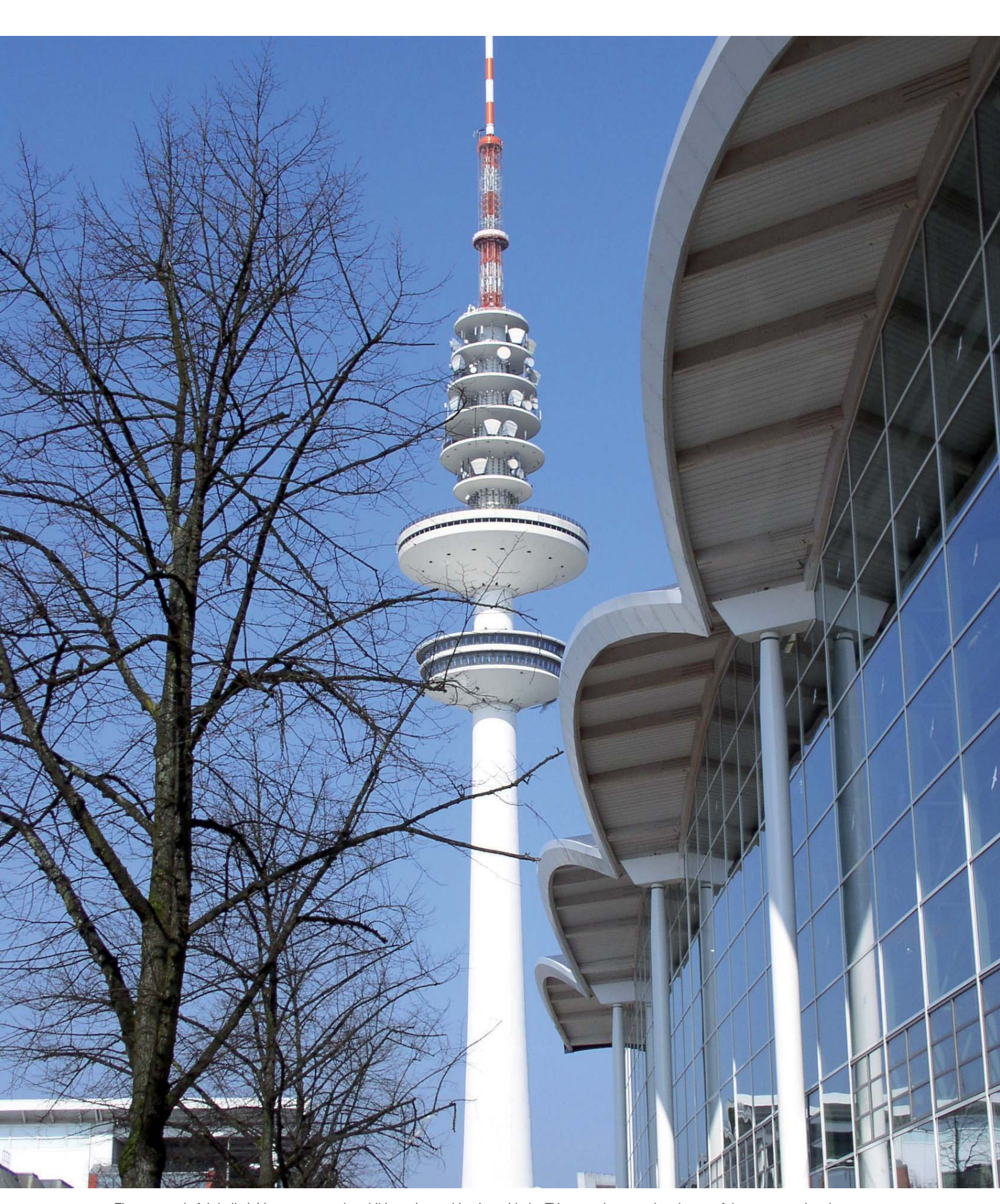
The new trade fair halls (r.) impress not only exhibitors. In combination with the TV tower, they are already one of the most popular photo motifs in Hamburg.