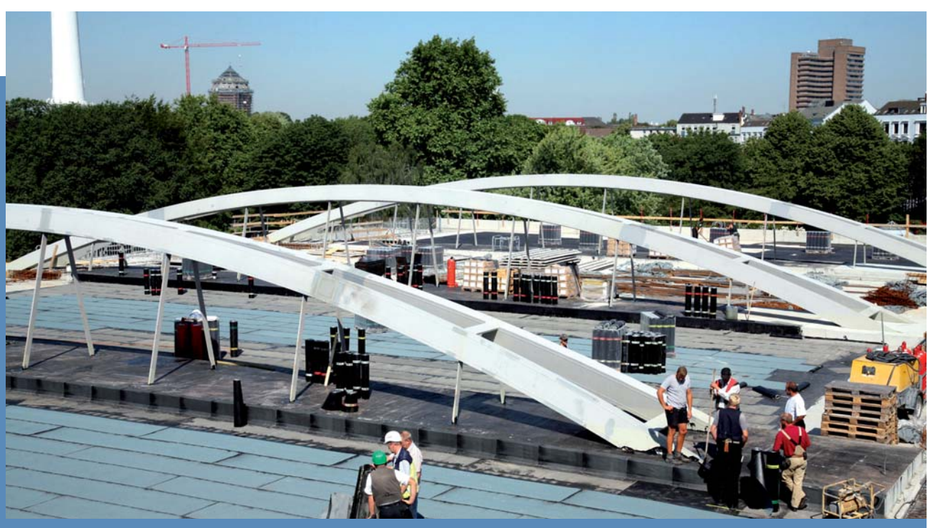
The roof of the CCH's multifunctional exhibition hall was completed in 2006. The largest rooftop garden in Europe is being created here in 2007.