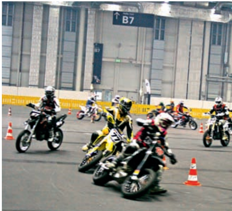
Hamburger Motorrad Tage

and tasting showcased their products. This included presents, new trends in gaming and handicrafts, as well as accessories and fashion for the autumn and winter collection of the sellers.